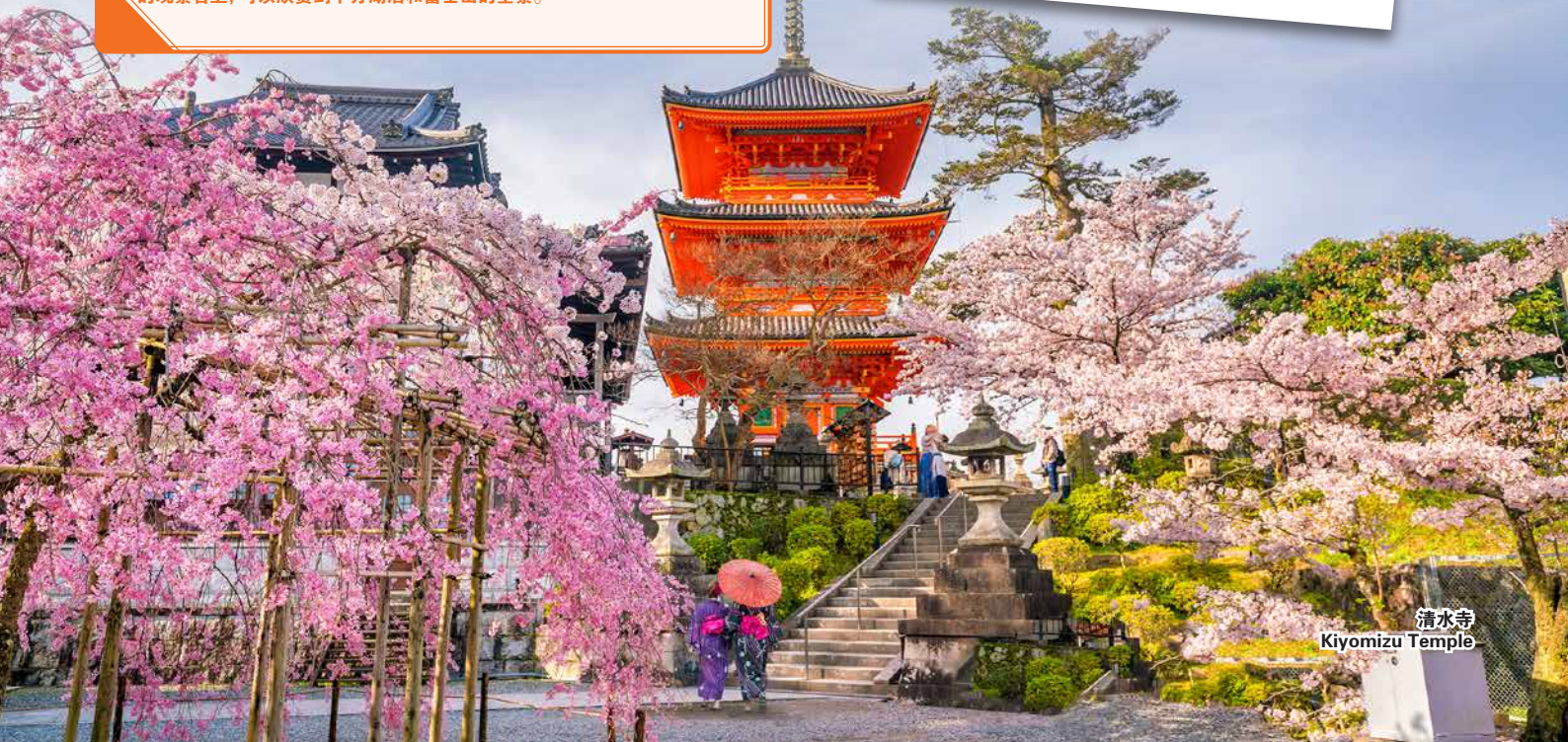
清水寺 Kiyomizu Temple