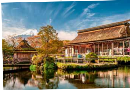
忍野八海 / Oshino Hakkai