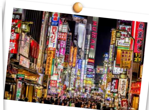
新宿 / Shinjuku